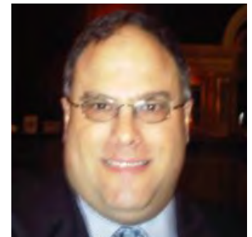
A JWUY: Ya Ub AG 7UdHU5X Jgfg